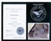
A Framed Adoption Certificate