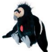
12" Condor Plushie

Honor someone special or memorialize a loved one. The Adoption makes a great gift for any occasion; birthdays, mother's day, anniversaries, holidays, or just to say "I care".