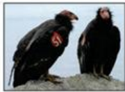
4x6 Condor Photo