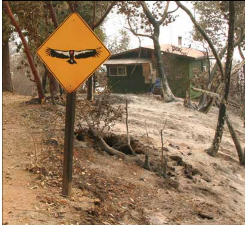
(above) Ashes from the Basin Complex fire surround our remote Big Sur field cabin. (right) Condor field crew faces winter challenges on its way to the condor sanctuary.

To go where the condors go can be a formidable task without a 9-foot plus wingspan. A hike to a condor nest, for example, might take us through dense chaparral and poison oak, and finish with the vertical ascent of a redwood tree. We are reminded that the condors are more at home and better equipped to flourish in the Ventana Wilderness than we are, even if we do sport the name Ventana Wildlife Society. When the elements conspire in their greatest severity, and the chips are down, we have always been fortified by the generosity of our members and supporters; the Coast Guard rescue of pre-release condors during the 2008 Basin Complex Fire and the donations that helped us rebuild the sanctuary facilities after that fire are just two memorable examples. We thank you for rising to the occasion when the elements have humbled us the most.