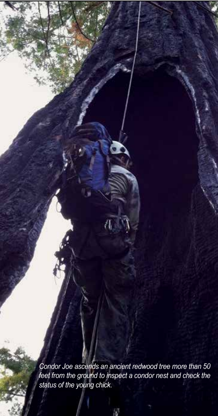
Condor Joe ascends an ancient redwood tree more than 50 feet from the ground to inspect a condor nest and check the status of the young chick.